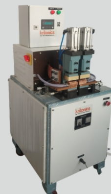
Automatic Butt Welding Machine