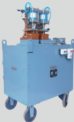
Pneumatic Butt Welding Machine