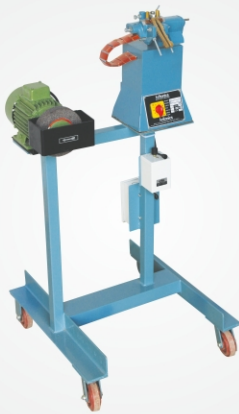
Micro Butt Welding Machine

Practically, our machines are used in every application in all walks of life. KRITONICS is producing these machines under strict quality assurance and comply customer's requirements on case-to-case basis. We are accredited with certification of ISO: 9001:2008 & ISO: 10002:2014 for our manufacturing plant at Vadodara, Gujarat, India.