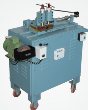
Upset Butt Welding Machine