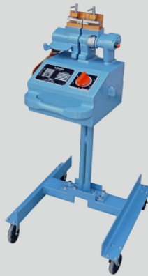
Strip Butt Welding Machine