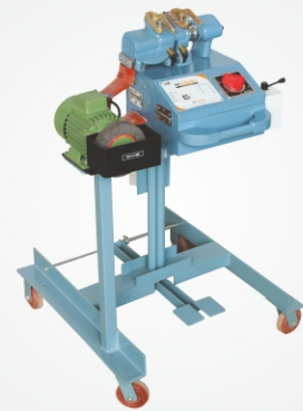
Wire Butt Welding Machine